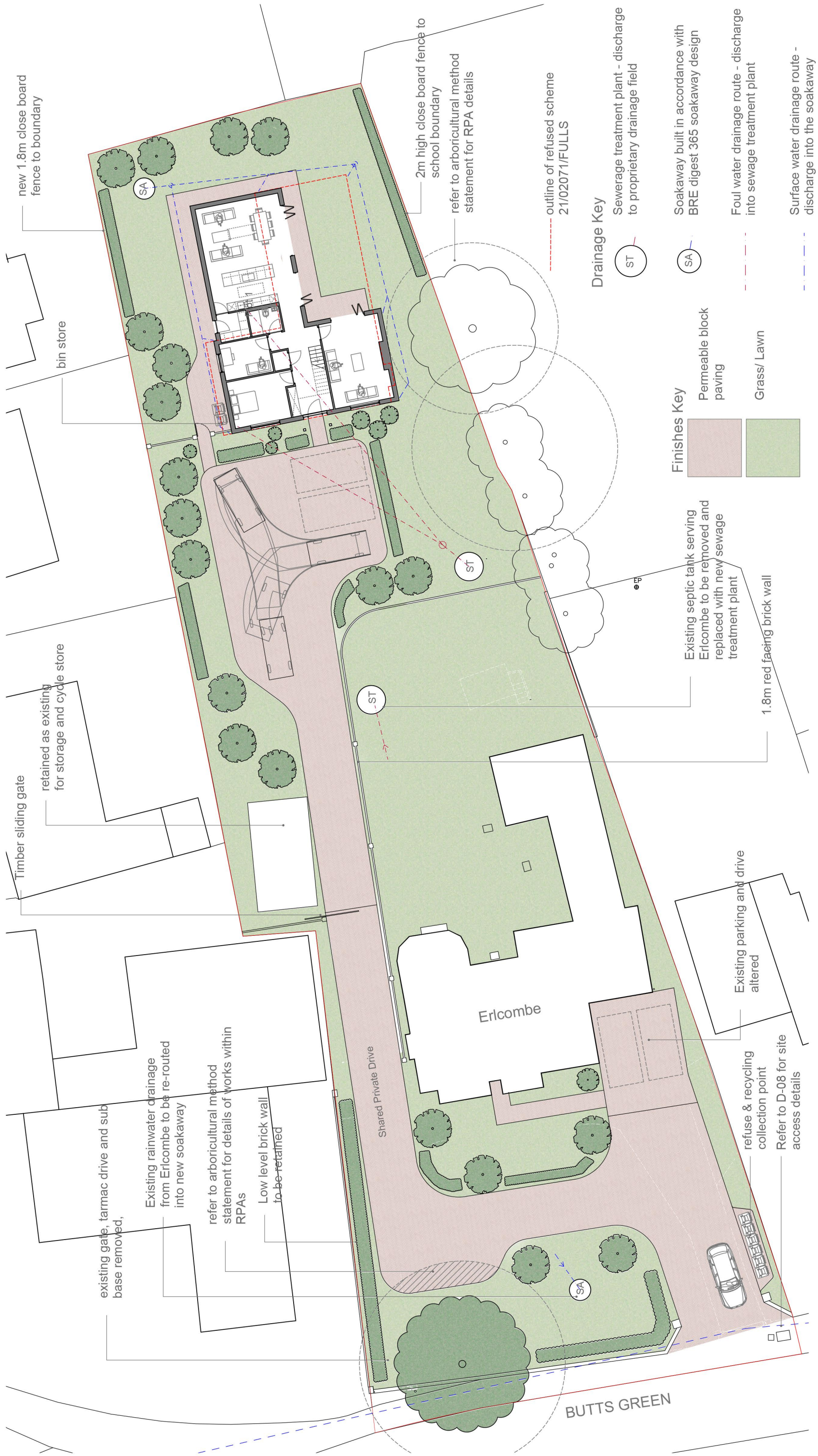
01 Proposed Site Plan

Foul and surface water drainage subject to specialist design in accordance with approved document H